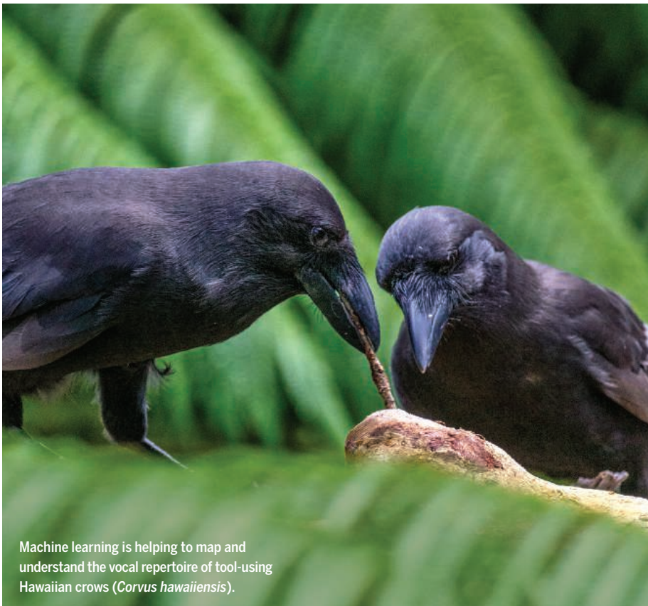
Machine learning is helping to map and understand the vocal repertoire of tool-using Hawaiian crows ( Corvus hawaiiensis ).

seek shelter. Establishing such correlations enables the formulation of hypotheses about signal function that can then be tested experimentally (e.g., with controlled playbacks).